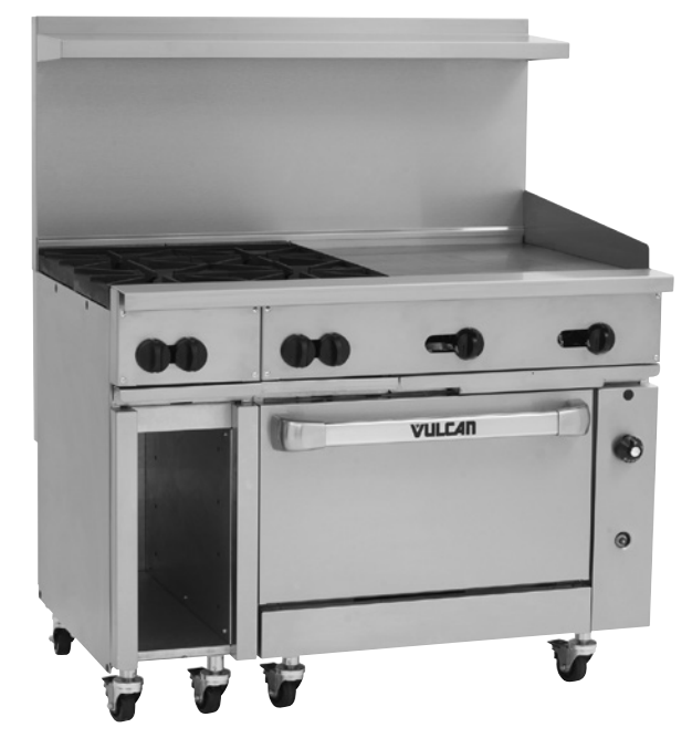
Model 48S-4B-24G-N (shown with optional casters)

4 OPEN BURNERS / 24" GRIDDLE 48" WIDE GAS RANGE